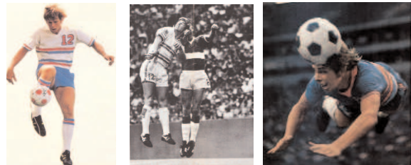
Kyle Rote, Jr. in action on the NASL Dallas Tornado in the 1968-69 season.