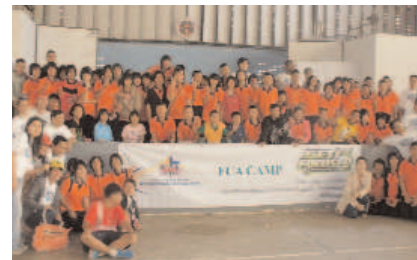
FCA camp in Thailand.