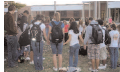
Sherwood HS students praying at the flag pole.

Please fill out the information below and return this form to: