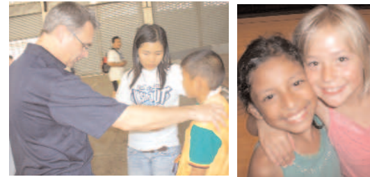
Top, Football prayer huddle. Left, Young boy accepting Christ in Thailand. Right, Young FCA Summer Campers.