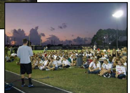
(Right) A combined total of 18 middle schools, high schools, and colleges attended the Fields of Faith event.