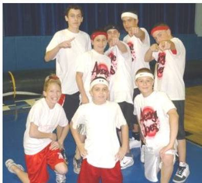
The Average Joe's win best dressed