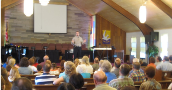
First Church of the Nazarene in St. Mary's